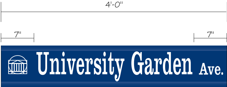
50% condensed text format

Samples Samples may be required prior to bid award.