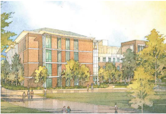
College of Arts and Sciences Research Building