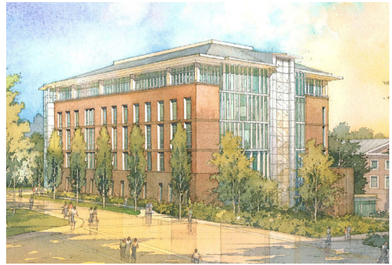
Rice Hall, School of Engineering and Applied Sciences