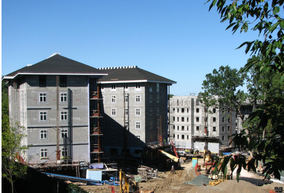
Alderman Road Housing, Phase II

area is undergoing a multi-phase redevelopment program. The first phase was completed with the construction of Kellogg House -- a 210 bed, 5-story dormitory with ground level student program space. Phase II is underway with demolition of Balz, Dobie and Watson Houses and construction of two new dorms and a student commons building. This phase should be complete in the spring of 2011. Phase III will begin next and will see the demolition of Maupin and Webb Houses and the construction of two more dorms. Phase IV will begin around 2013 and will consist of a single residence hall and will contain classroom space as well. When these phases are complete, there will be approximately 500 additional beds in the Alderman Road Housing area.