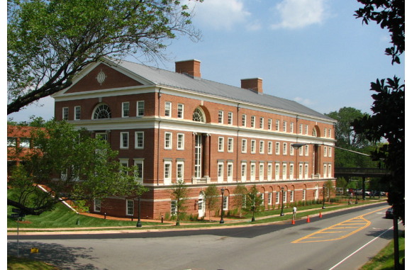
Bavaro Hall, completed in 2010

Parking and Transportation has an important presence in the precinct. There are approximately 3,200 parking spaces in the precinct, located mostly at Scott Stadium, so while there is ample parking it is not always located in the most desired places. This has been further compounded by the loss of parking due to the CAS and Rice Hall building projects. Currently, P & T and the Office of the Architect are supporting the continued development of the transportation demand management (TDM) plan with a goal of reducing the number of single occupancy vehicles that are driven and parked on Grounds. TDM strategies will help to address some of the parking issues in the precinct, although parking for Scott Stadium events will continue to be an issue.